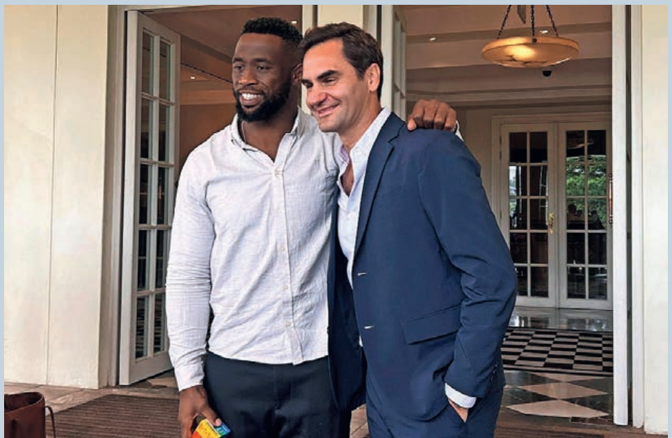
Roger Federer and Springbok star Siya Kolisi pose for photographs after a press conference on the Roger Federer Foundation's work in early childhood education across Southern Africa in Johannesburg, South Africa.

His foundation has given grants worth millions of dollars for early learning projects across six Southern