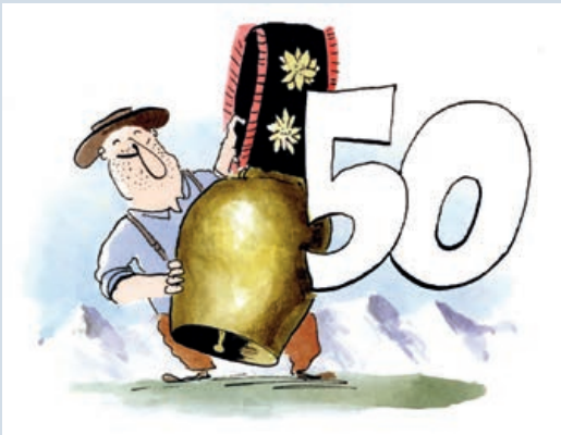
Cartoon: Max Spring

The full article was published in the July 2024 edition or read it at https://tinyurl.com/swissreviewarticle .