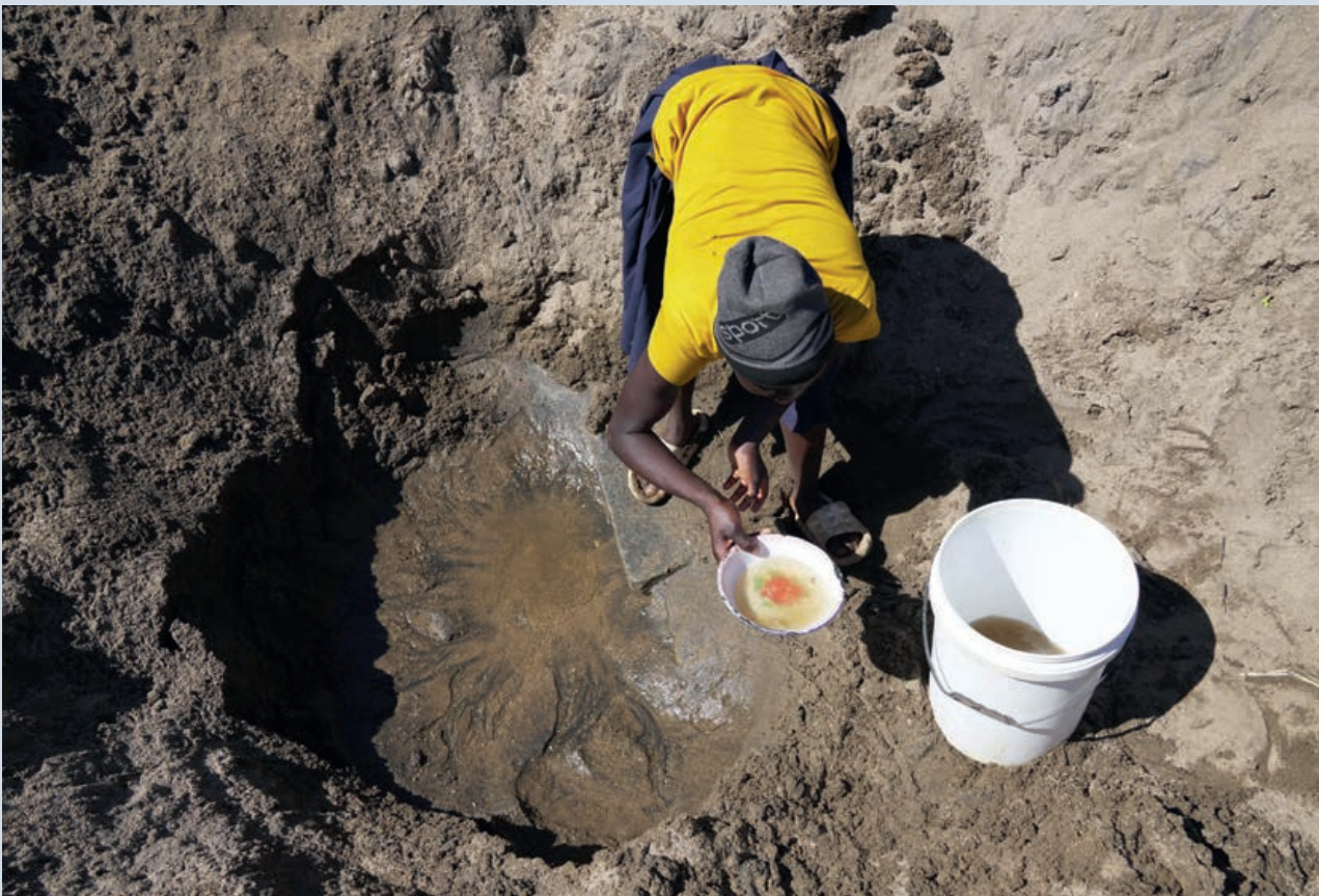
Communities are facing acute water shortages in Southern Africa which has forced women to walk long distances in search of the precious liquid.

As Southern Africa continues to battle this historic drought, Switzerland's aid is crucial in addressing immediate needs while laying the groundwork for long-term recovery and resilience.