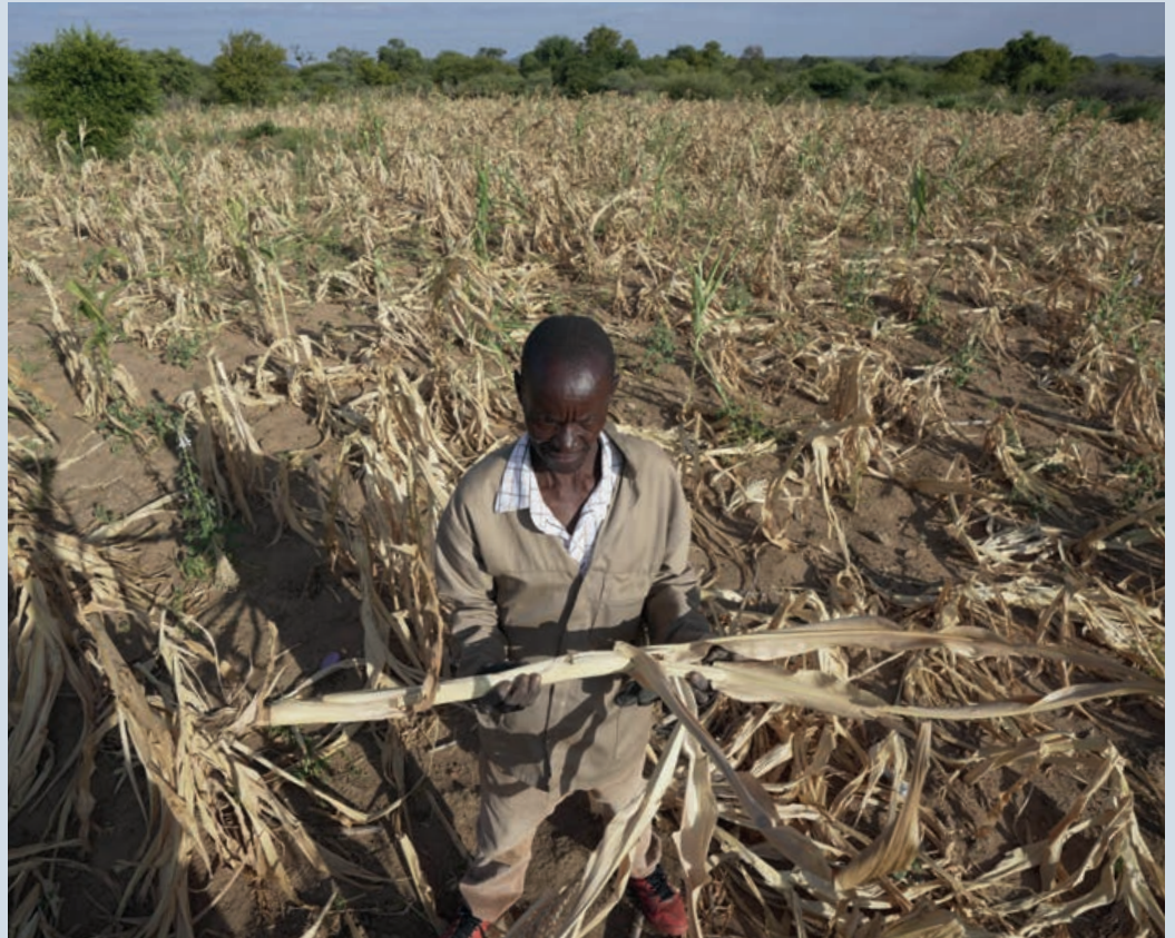
Man from rural Zimbabwe inspecting his failed crop in Mashonaland West Province.

The drought, driven by the El Niño climate phenomenon and exacerbated by climate change, has devastated Zimbabwe, most of Zambia, and southern Malawi. With almost no rain during the critical growing season and temperatures soaring five degrees above average, crops have failed across the region, leaving over 30 million people facing severe food and water shortages.