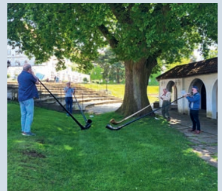
A number of Swiss people also present.