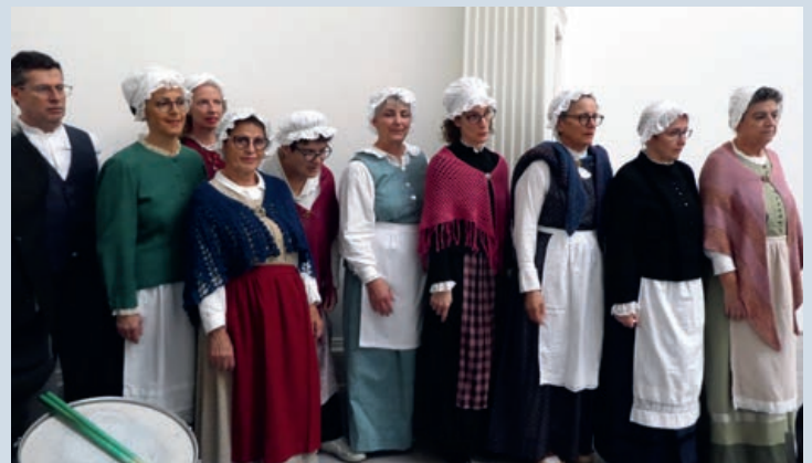
La Voce del Brenno Choir at The Swiss Church, London.