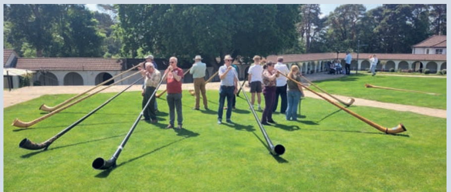
BBC TV, radio and press coverage conveyed the joy, delight and uniqueness of the special day.