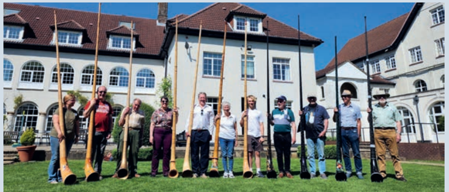
Bringing the experience to UK alphorn owners to play in Alpine ensembles.