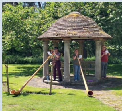
The weather was perfect!