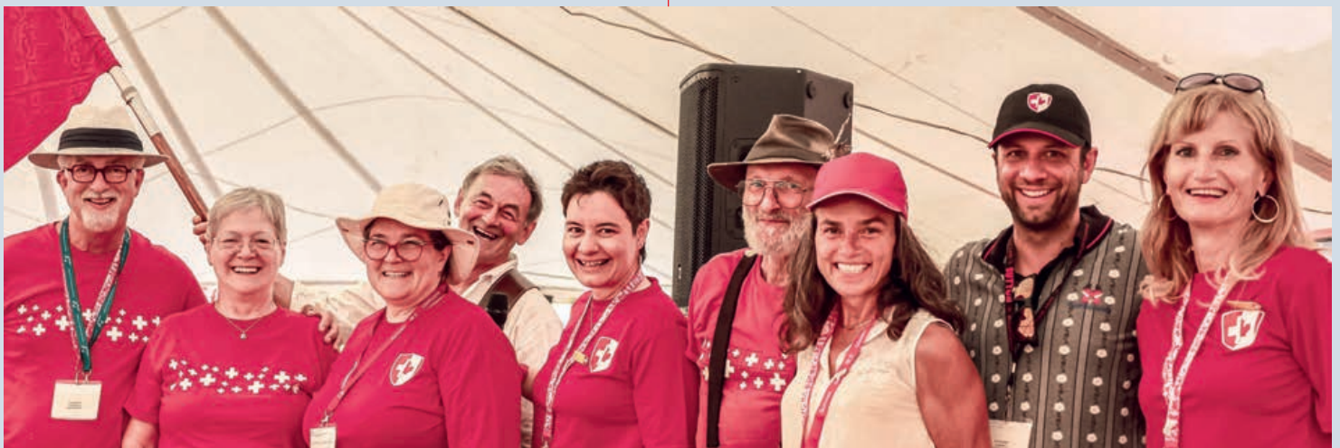
VOTRE COMITÉ 2024

We're always looking for people interested in taking on responsibilities to be part of our organising committee. Contact us at fedesuisse@gmail.com .