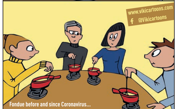
Fondue before and since Coronavirus...