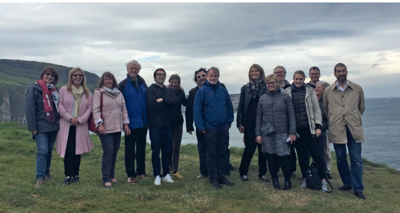
Some of FOSSUK's AGM participants during a trip to the Giant's Causeway. The event took place in Belfast in 2018.