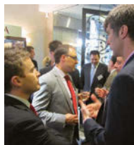
SwissCham EuroMix Eat, Meet & Greet in Sydney and Melbourne 10 & 17 Sept 2014