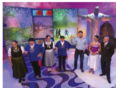
Swiss Dance off

It was much fun, tiring too, but with our traditional outfits we looked the part at all times.