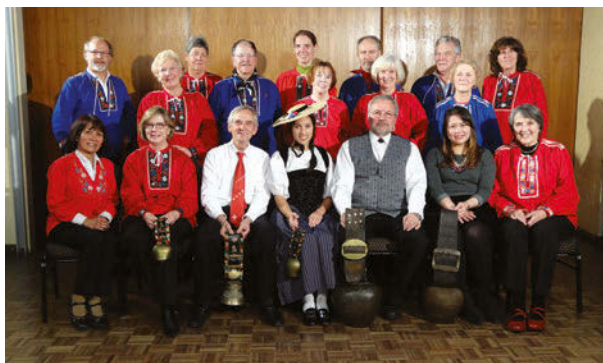
'Crèmeschnitte Chörl' Canberra Swiss choir

Spring in Canberra is an exciting time for soul and mind. It marks the end of winter and gives way to a season full of colours in 'Floriade', the flower festival bringing new life into the city. This is a fabulous time of the year. But that's not all, we have more reason to celebrate. The German Choral Festival 'Sängerfest 2014' is held for the first