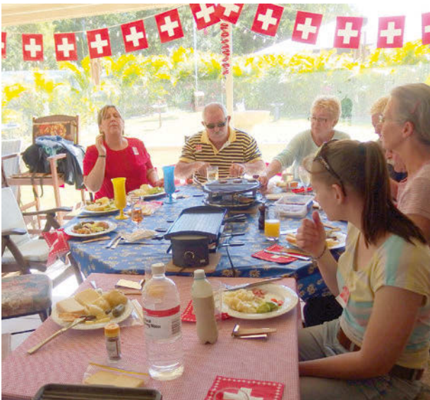
Swiss Raclette, Fraser Coast