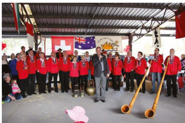
Swiss Yodlers of Sydney

On 29 November, we will perform at the Senior's lunch at the Concordia Club in Tempe.