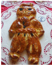
Samichlaus with Grittibänzen, Fraser Coast