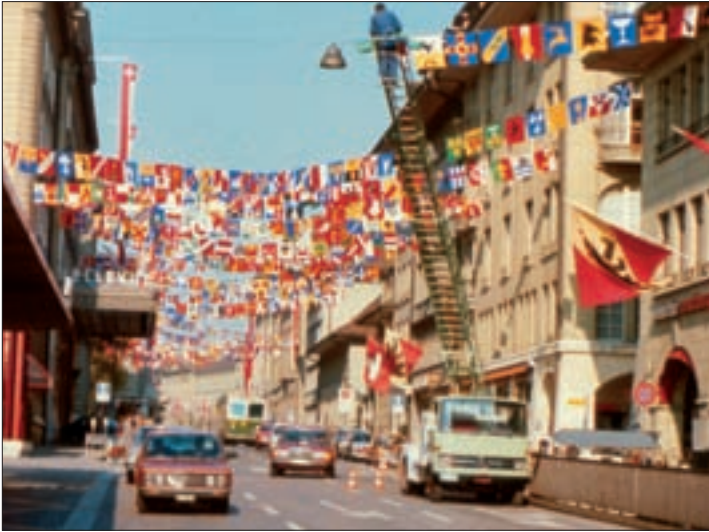
Garlands of flags are flying everywhere, decorating tiny villages through which the Queen's motorcade passes and festooning city streets, like here in Zurich