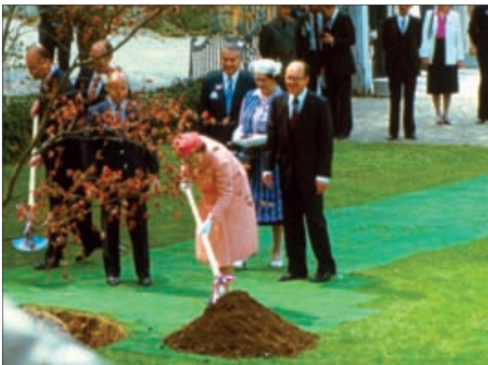
A moment of tranquility: While crowds were kept in the background the Queen plants a commemorative tree in the grounds of the Basle Garden Festival

But for years afterwards the Iron Lady took her annual summer holiday during the Parliamentary recess...in Switzerland!