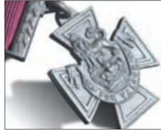
The Victoria Cross: Britain's highest award for valour on the battlefield

At the height of the battle he tore off his bandages, limped to the makeshift defences, and as Zulus leapt over the barricade dispatched them one by one with