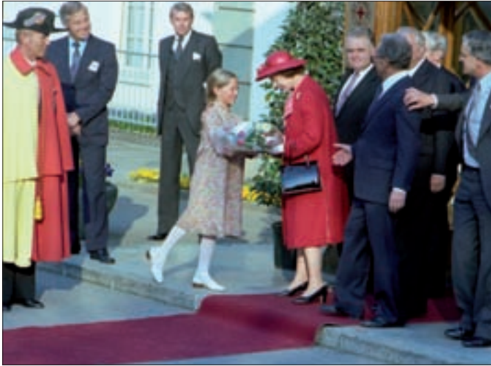
One of the many bouquets she received during the tour – this time while calling on the International Committee of the Red Cross at their headquarters in Geneva