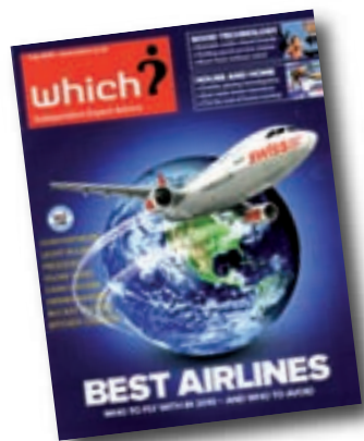
Accolade: The front cover of the July issue of Which? shows SWISS flying high

"Last, but not least, it's the SWISSNESS which is part of our culture which differentiates us from other airlines."