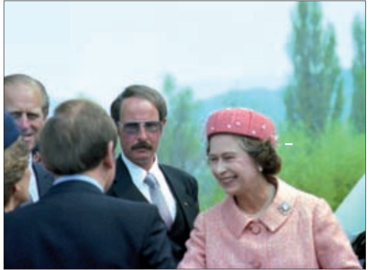
Another day, another dress change: The Queen arrives at the 13th century Chillon Castle for a banquet given by the Government of Canton Vaud