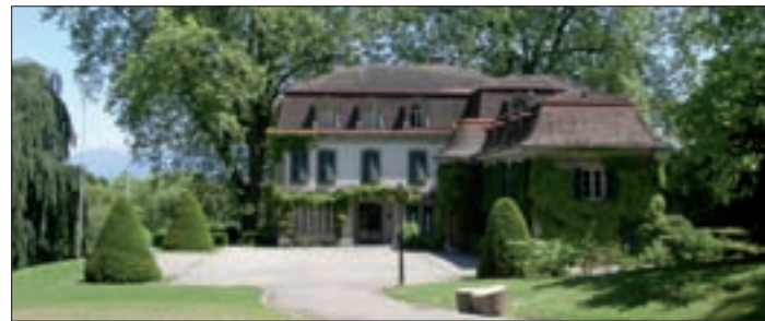
The Château de Penthes, home of the Museum of the Swiss Abroad in Geneva

It will also show how the Zulus were armed with their deadly assegais and leopard skin shields. And there will also be a replica of the VC itself.