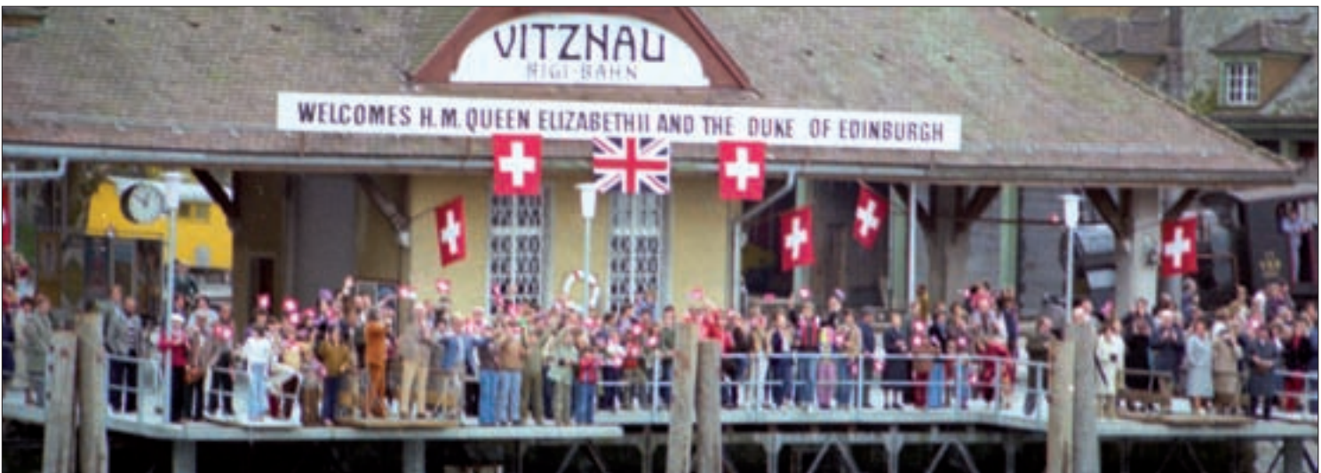
An excited crowd waits on the landing stage at Vitznau to welcome the Queen and Duke as they pay a courtesy call during their trip on a lake steamer to the Rütli meadow

In Berne, for instance, all the capital's famous fountains had been specially gilded for the occasion. It made this most unreal of all Swiss cities look even more like a stage set, with the air of having been completely refurbished