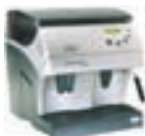
SOLIS Master 5000 Digital, $ 899.00