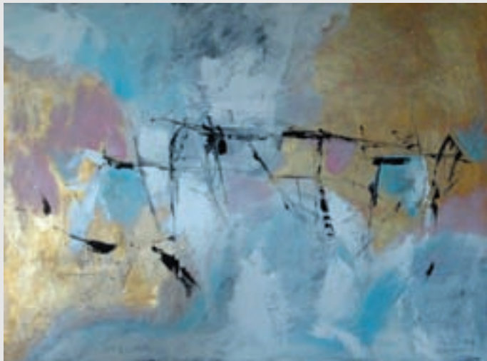
Meditative Landscape Nr. 1