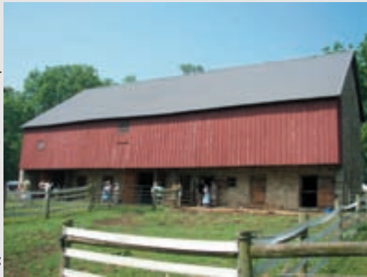
Classic Swiss Style Barn with Foray, built in the US

Swiss Barn Of Monroe, 1870-80's, square nail construction, hand hewn oak, floor joists are 12 inches on center. Lauren Meinent, 608-325-4298, Barn Located at N3793 County M, Monroe WI 53566, Green County WI,