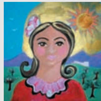
Illustration: La Perla/A Fairy Tale but I leave it open to the interpretation of the viewer."

"I love the cultural richness of San Marcos and the Texas Hill Country and would like to leave something behind to contribute culturally to society," she said, "my abstract artwork does not only landscape/nature but also many impressions of different cultures. Symbols do play a role