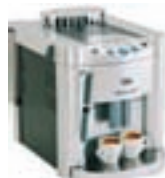
SOLIS Palazzo $ 999.00