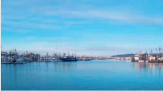
The harbour of Homer, Alaska