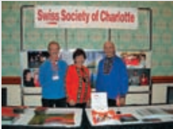
Members of the Swiss Society at the Charlotte Symphony's "Lobby Festival"

We were also represented at the Charlotte Symphony's "Lobby Festival" on March 5 th and 6 th