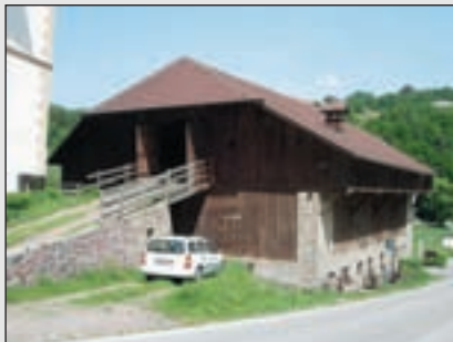
Easy Access to the Hay Loft

- National Barn Alliance, www.barnalliance.org - Historic Barn & Farm Foundation of Pennsylvania, pahiustorichbarns.org - Swiss Center North America, WI www.theswisscenter.com - Green County Tourism, www.GreenCounty.org - Graubunden- Prättigau Tourismus, info@praettigau.info . - Switzerland Tourism 212-757-5944, Ext. 232 / Fax: 212-262-6116, tanya.eggenberger@switzerland.com .