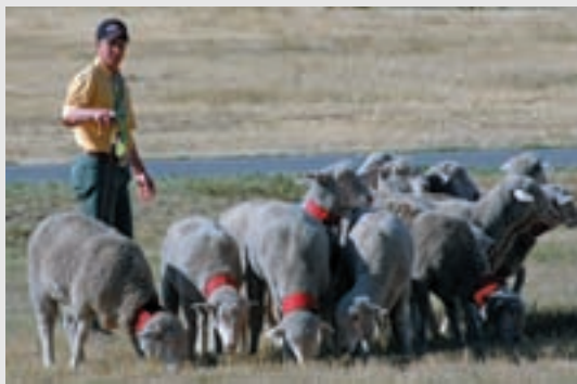
Checking out the flock