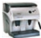
SOLIS Master 5000 $ 799.00

The NEW Palazzo from SOLIS is the ultimate in home espresso machines. It offers: Espresso and Café Crème at the touch of a button; Steam at the turn of a knob; and a built in bypass chute that permits the use of pre-ground coffee (decaf) so that no one is left out. Producing delicious coffeehouse quality lattes and cappuccinos at home has never been so easy.